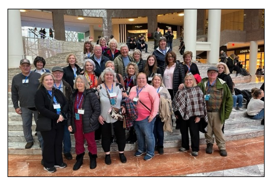
ARTA travelers at the American Express Center—New York City Spotlight, December 2022

Eligible retirees can enroll in retiree coverage one time. If you decline coverage, you will have to take multiple steps to apply later. If you drop coverage, you will not be able to rejoin later.