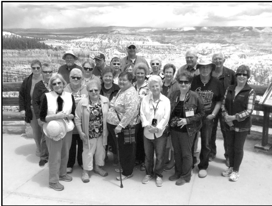
ARTA travelers enjoyed a trip to Canyon Country in May.

October 2017—Bus Trip to the Amish Country DATE TO BE ANNOUNCED