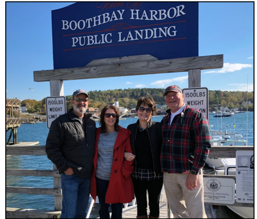
Booth Bay Harbor, Maine (Colors of New England, October 2018)