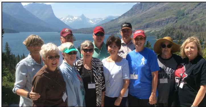
Canadian Rockies & Glacier National Park, August 2018

ARTA members and their families are invited to join us for fun and exciting trips of a lifetime!