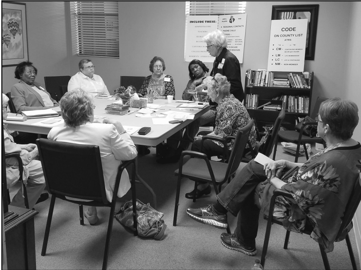
Membership chairpersons hard at work during a breakout session at the Area V Spring Conference.