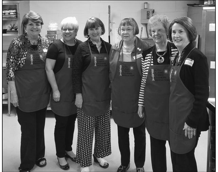
Members of the South Pulaski RTA stand ready to serve at the Area VI Spring Conference.

Visit the new and improved ARTA web site, www.artanow.com , to view the latest travel opportunities, download informative materials, or share the ARTA community with potential members.