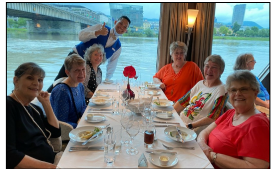
Danube River Cruise September/October 2022