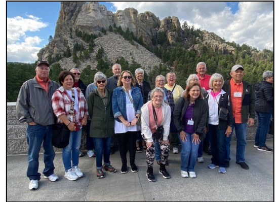
Cowboy Country September 2022