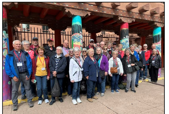
Albuquerque Balloon Fiesta October 2022