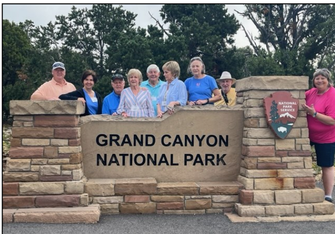
Canyon Country, September 2023

“Start spreading the news,” because today you arrive in America’s most exciting metropolis as it shines during the holiday season. Your New York City getaway is filled with shopping, sightseeing, endless entertainment and holiday cheer. Highlights include Greenwich Village, Wall Street, Christmas Spectacular at Radio City Music Hall, Statue of Liberty, Ellis Island, 9/11 Memorial, 9/11 Museum, and a Broadway Show. Save $400 pp—Book by May 23, 2024