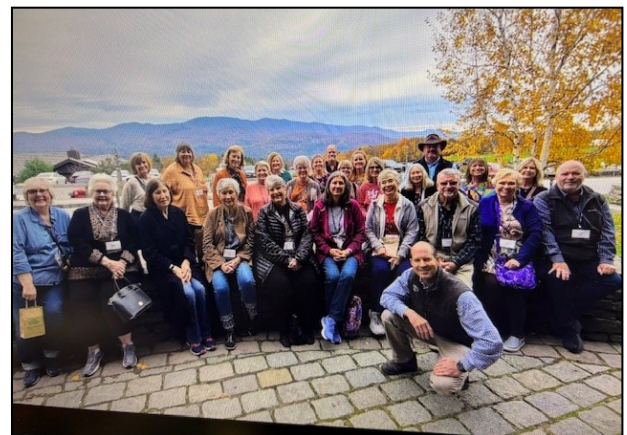
Postcards from Vermont, October 2023