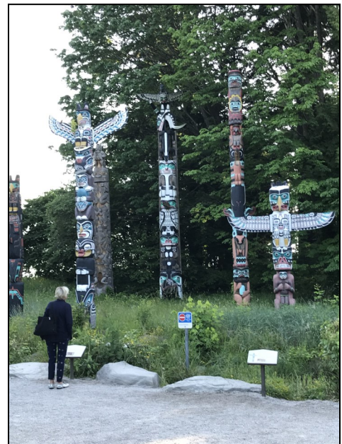
An ARTA traveler reads about the First Nation Totem Poles in Stanley Park, Vancouver, British Columbia.