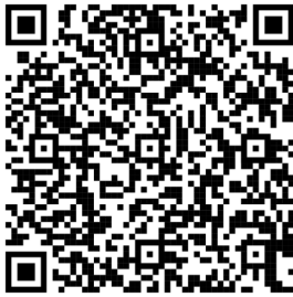
2023-2024 ARTA Annual Report